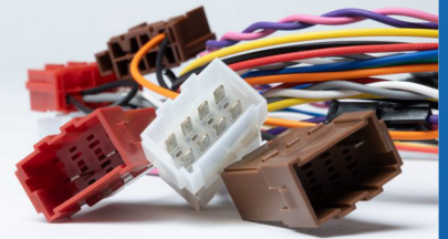
1 X TACHO LOOM