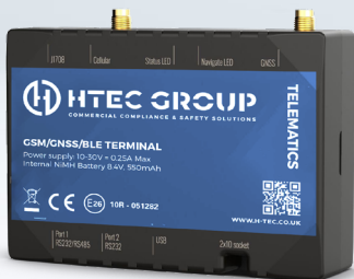
1 X H-TEC REMOTE DOWNLOAD DEVICE