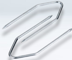
1 X PAIR OF TACHO REMOVAL PINS